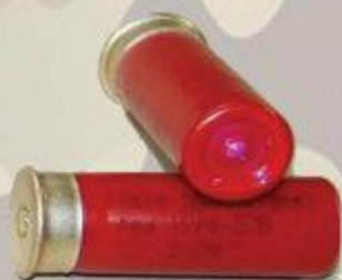
26mm Signal Pistol Cartridge (red)