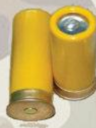
26mm Signal Pistol Cartridge (yellow)