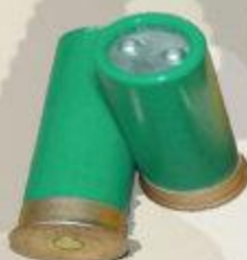
26mm Signal Pistol Cartridge (green)